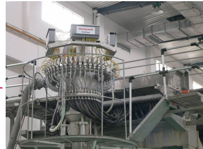
Honeywell ProFlow System, installed on B&H Distributor Ø 1100